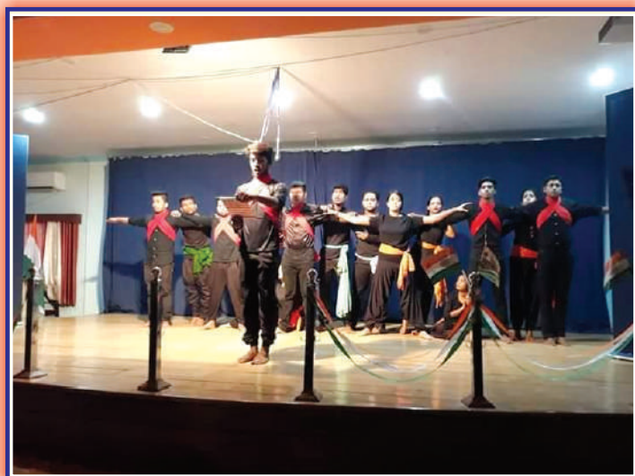
TROUPE members winning hearts