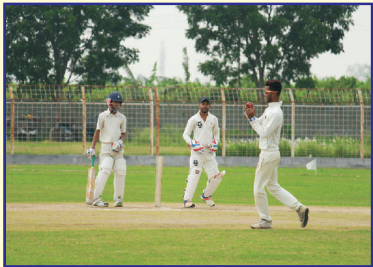
Cricket Match in progress