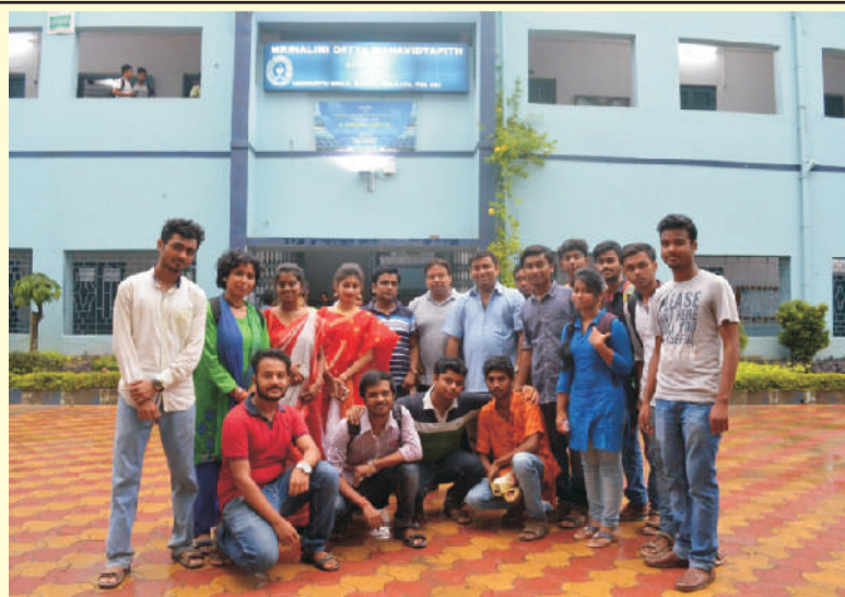
Students and faculties of the department

Head of the Department (Contact No. 9062644150)