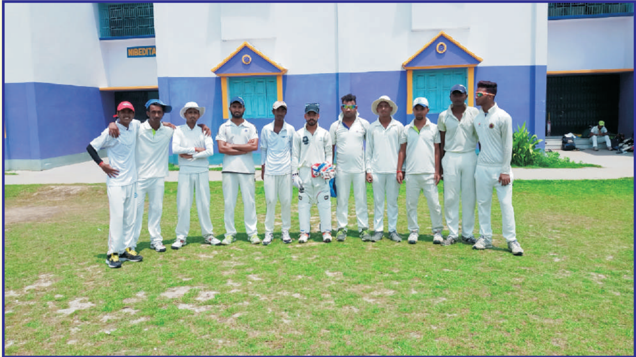
Cricket team of our college