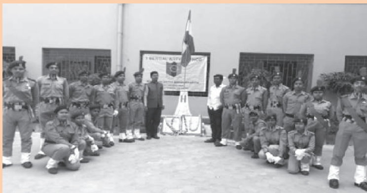
Celebration of Republic Day by NCC Cadets

Contact us (Mob. 9243269721) for enrolment and training programme.