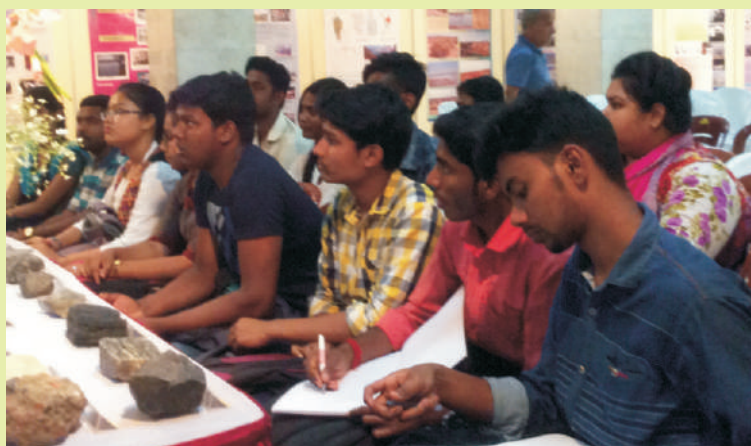
Students undergoing Hands-on Training Course on Rocks and Minerals identification at GSI

Head of the Department (Contact No.9830118983)