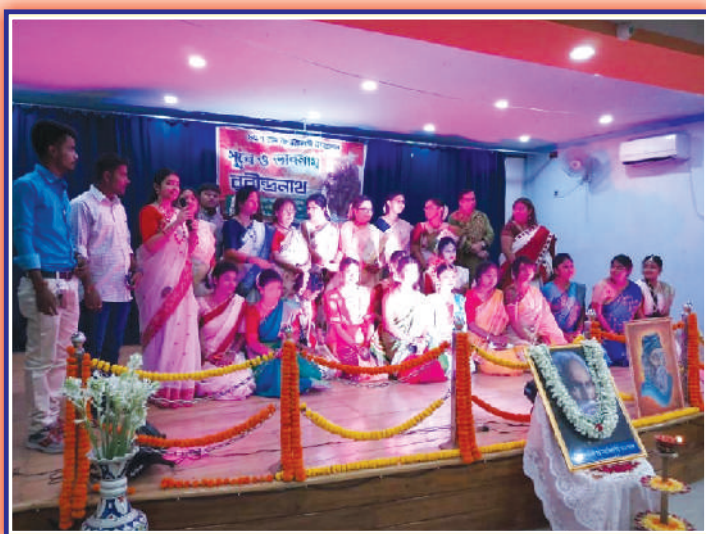
Rabindra Jayanti Celebration by Cultural Sub-Committee