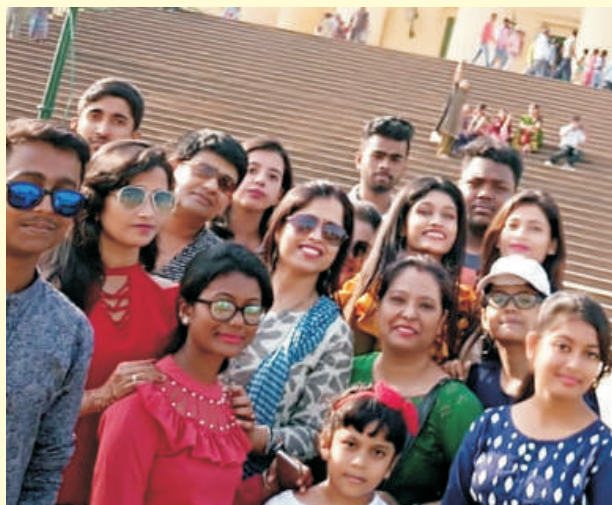
Educational excursion at Murshidabad

Head of the Department (Contact No.9051665711)