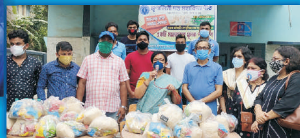
Relief Work for 'Yaas' affected People : Smt. Chandrima Bhattacharya, Minister of States, inspiring students with her words