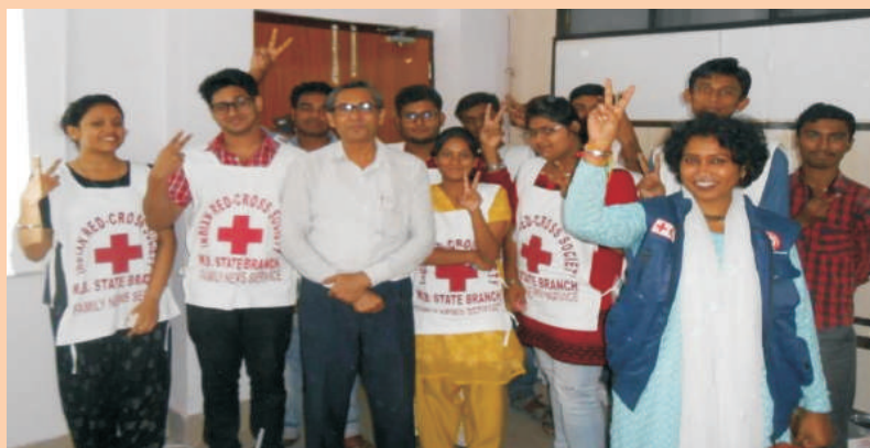
Workshop of YABC (Youth as Agent of Behavioural Change)