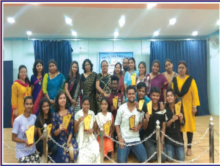
Intra college competition organized by Cultrual Committee