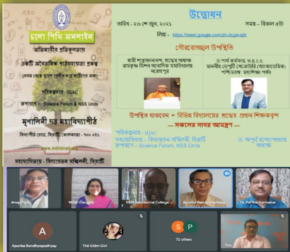
“চলো শিখি অনলাইন” : A Free Coaching to School Students of IX-XII