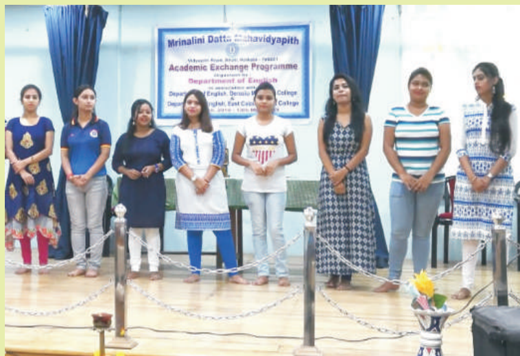
Academic exchange programme

Mail id: mdmenglish2018@gmail.com Head of the Department (Contact No.9831598089)