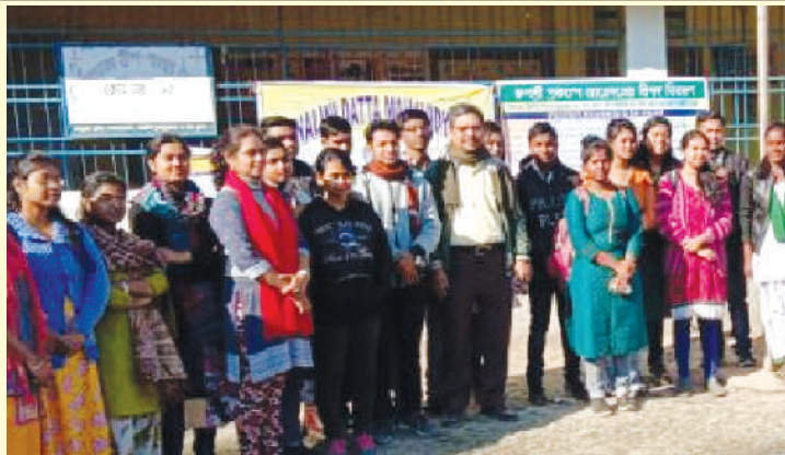
Field visit and awareness camp at Andu Bana Basti, Alipurduar District.

Mail id: mdmanth@gmail.com Head of the Department (Contact No. 9830126687)