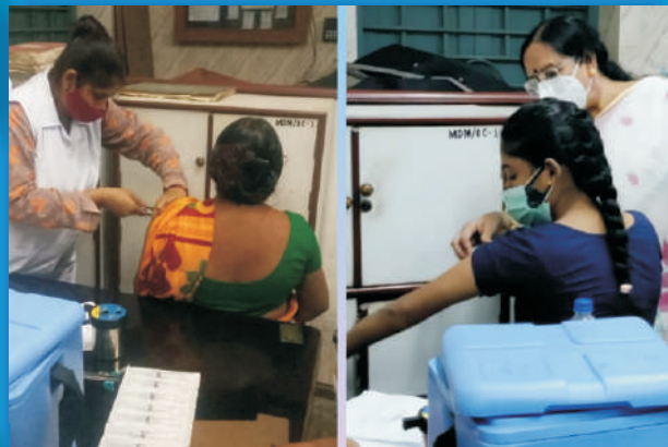
Covid-19 Vaccination Drive initiated by the College