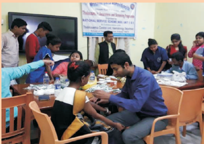
Thalassemia awareness programme

Contact us (Mob. 9804763152 / 9163053936) for enrolment and training programme.