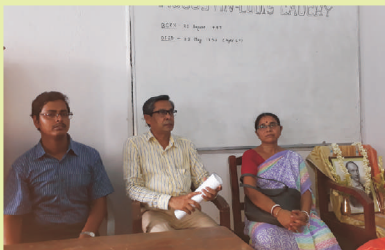
Birthday Celebration of Augustin-Louis Cauchy

Head of the Department (Contact No.9243269721)