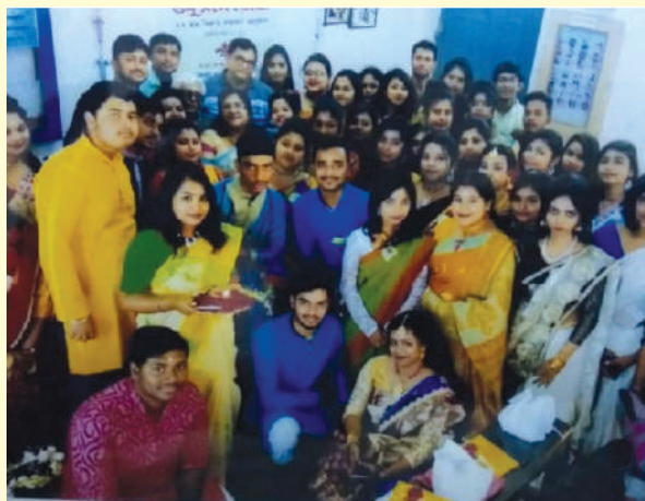
Basanto Utsav at the department

Mail id: mdmbengali@gmail.com Head of the Department UG (Contact No.9831875442) PG (Contact No.9433566368)