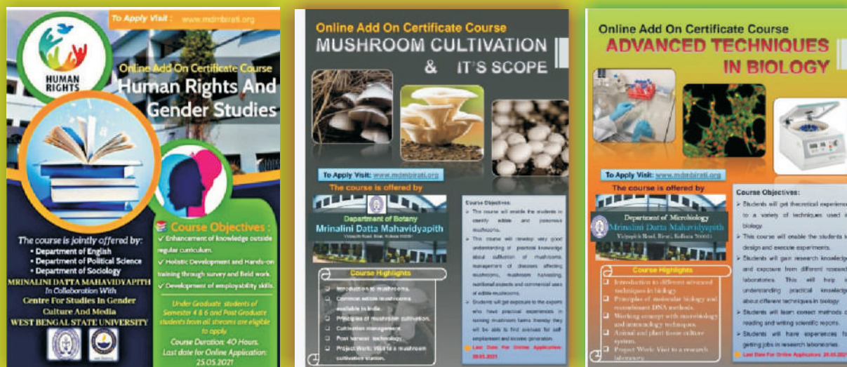
Online Add on Certificate Courses : New initiatives by various Departments