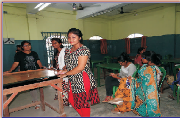
Girls' Common Room