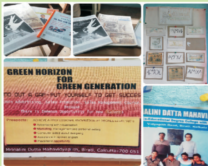
Year round activities of the department

The goal of education is not memorizing the academic content but construction and reconstruction of life experiences and relating them to the academics thereby acquiring higher orders of learning. B.Com. General Course with advertising and Sales Promotion aims at equipping students with finer nuances of advertising, Sales Promotion, Public Relations and Sales Force Management. This program enables the students to develop skills required for job/vocation in advertising, personal selling and salesmanship. On the other hand, a student also will be equipped with skills required to motivate and train the sales force and enhance their productivity.