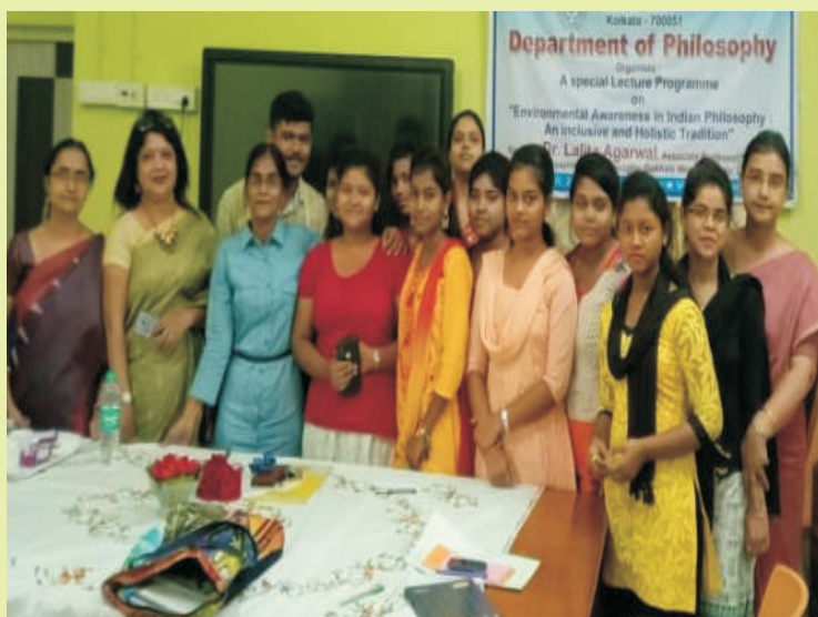
A special lecture programme

Head of the Department (Contact No. 9831074360)