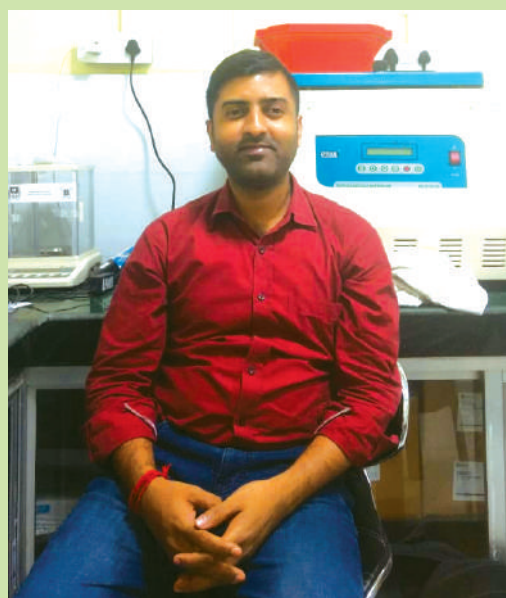
Year round activities of the department

Mail id: microbiology.mdmbarati@gmail.com Co-ordinator (Contact No. 9674556114)