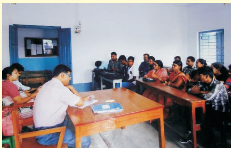
Parents-Teachers Meeting of the Department

Head of the Department (Contact No.9432219400)