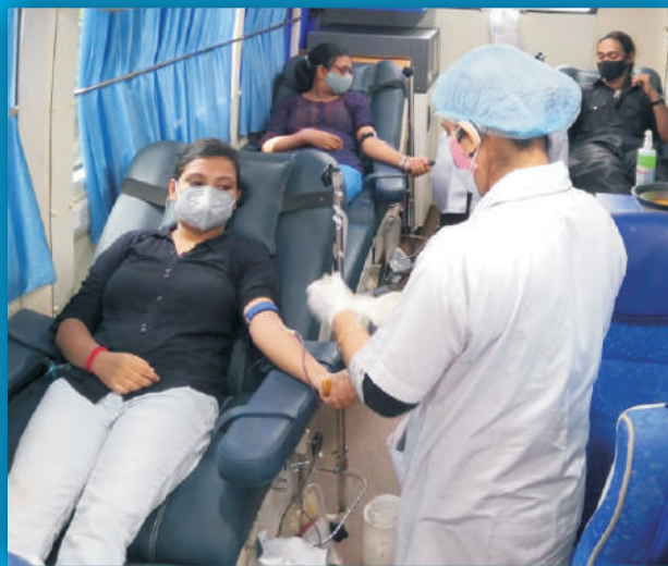
Blood Donation Camp in our College