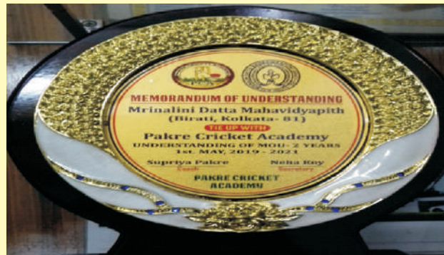
Memorandum of Understanding of MDMCA

Mrinalini Datta Mahavidyapith has entered into a partnership with Pakre Cricket Academy(59 th Ananth Nath Deb Lane; Belgachia, Kolkata- 700037) to form Mrinalini Datta Mahavidyapith Cricket Academy (MDMCA). The Training Partner will remain responsible in imparting Cricket Training Course to the students enrolled with Mrinalini Datta Mahavidyapith Cricket Academy and in issuing Certificates to them jointly by the college and the Training Partner on successful completion of the course. The training will be imparted from the session, 2019-2020. The Training Partner will impart training to the enrolled students within the college playground. The Cricket Training Course for the prospective college students will be provided by the Training Partner free of cost.