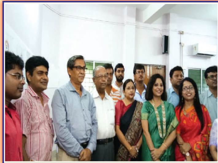
Dignitaries present in the International Seminar commemorating the hundred years of Quit India Movement