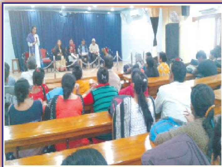
Academic Counselling Session