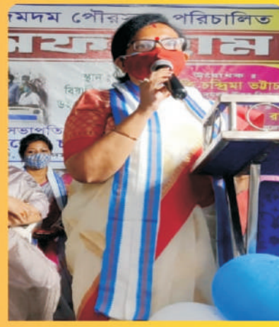
Inauguration of the "Kabiguru Safe Home" : our college responding to the crisis of Covid-19 Pandemic.