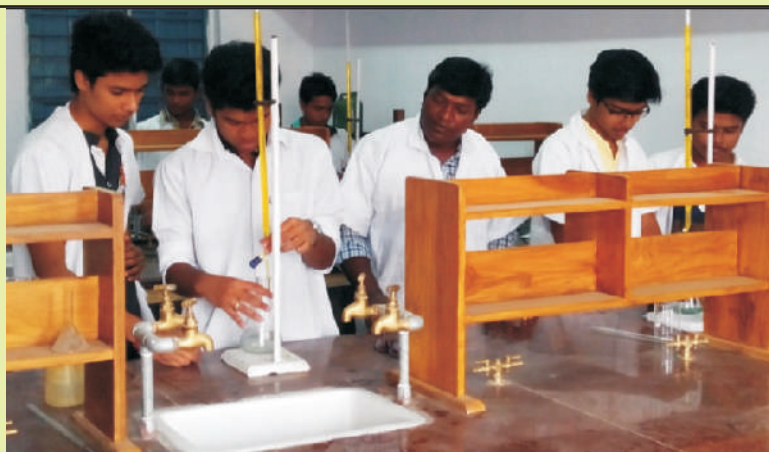
Students are doing practical in laboratory

Head of the Department (Contact No. 9874556847)