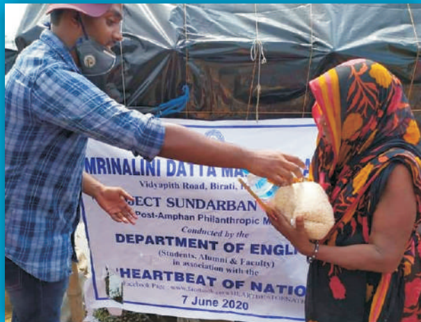
Post-Amphan Philanthropic Endeavours : When Education transcends the Curriculum