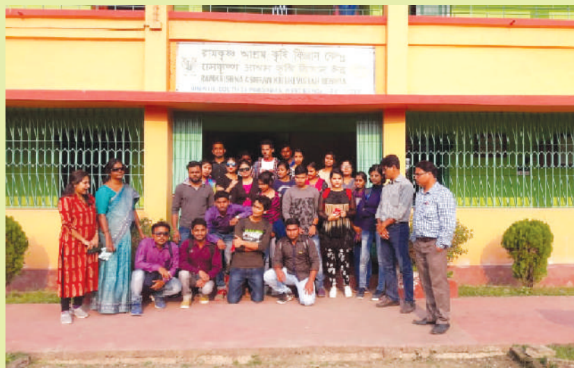
Local excursion in Sri Ramakrishna Ashram Krishi Vigyan Kendra, Nimpith, 24Pgs(S).

Head of the Department (Contact No. 9674556114)