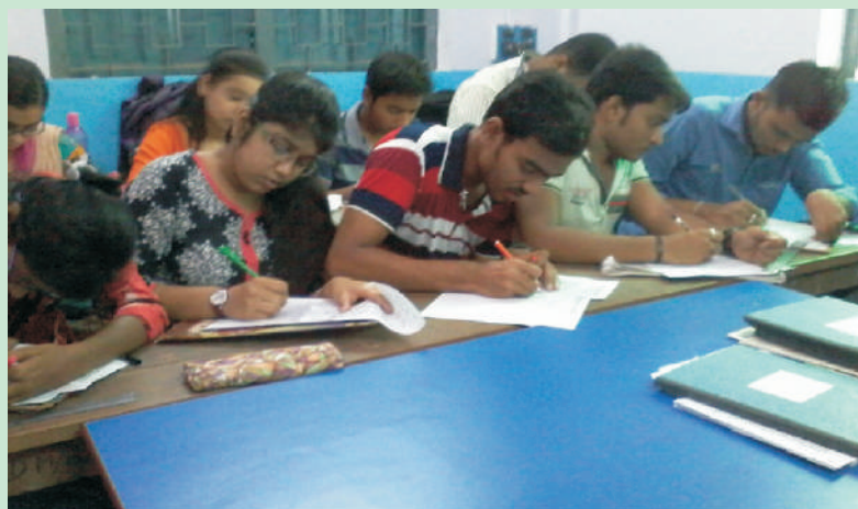
Students of the department

Mail id: economicismdm@gmail.com Head of the Department (Contact No.9830775198)