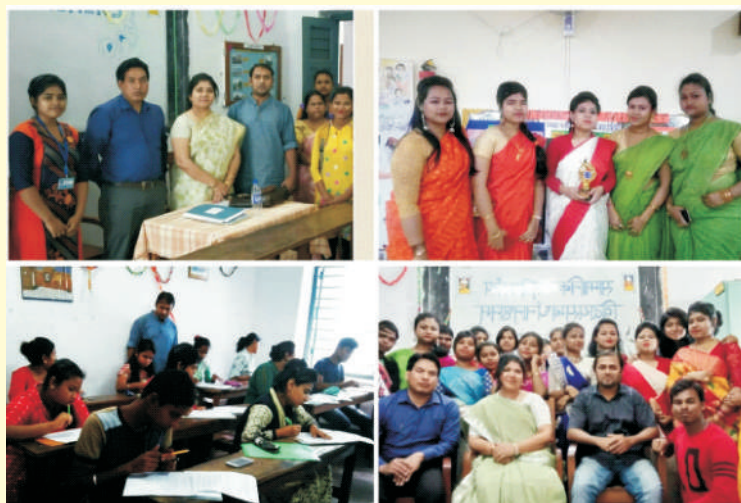
Departmental Programme and Examination

Mail id: sanskritmdm@gmail.com Head of the Department (Contact No. 9433425476)