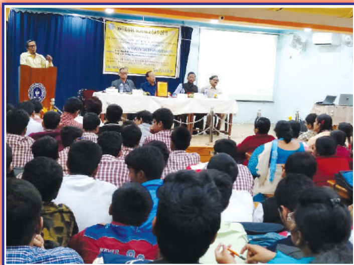
Celebration of National Science Day in our college