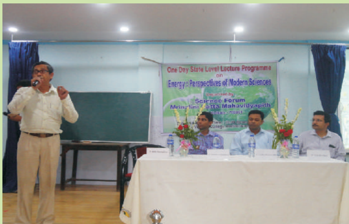
Participation of the department in science forum programme

Head of the Department (Contact No.8910539134)