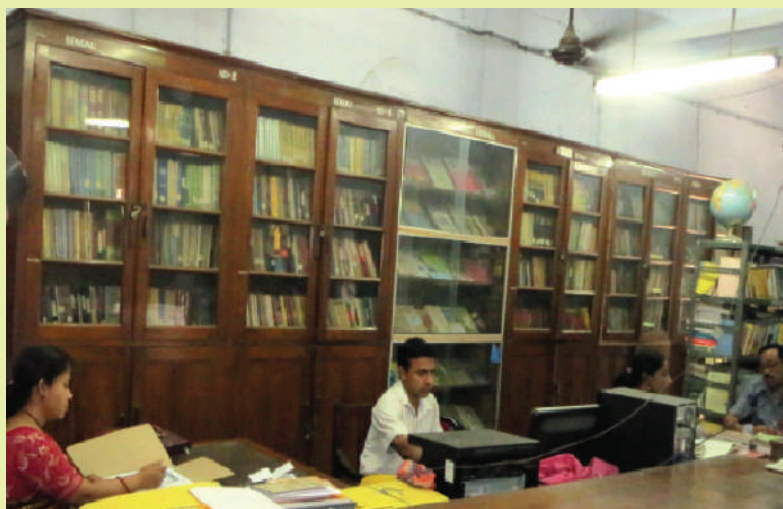
Library Staff Members

Mail id: librarymdm@gmail.com (Contact No. : 9433331981)