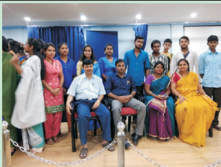
Academic Counselling Programme for 3 rd Year Students

Mail id: mdmeducation1@gmail.com Head of the Department (Contact No. 9433306060)