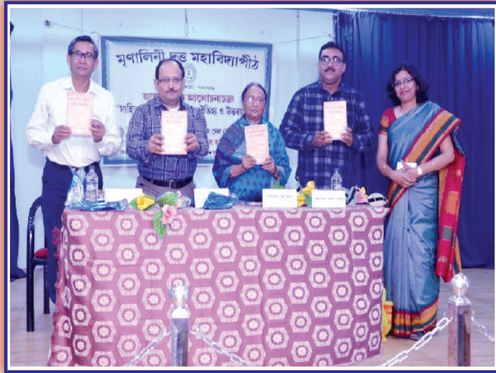
Moment of Pride : Prestigious Book Release in the IQAC collaborated International Seminar